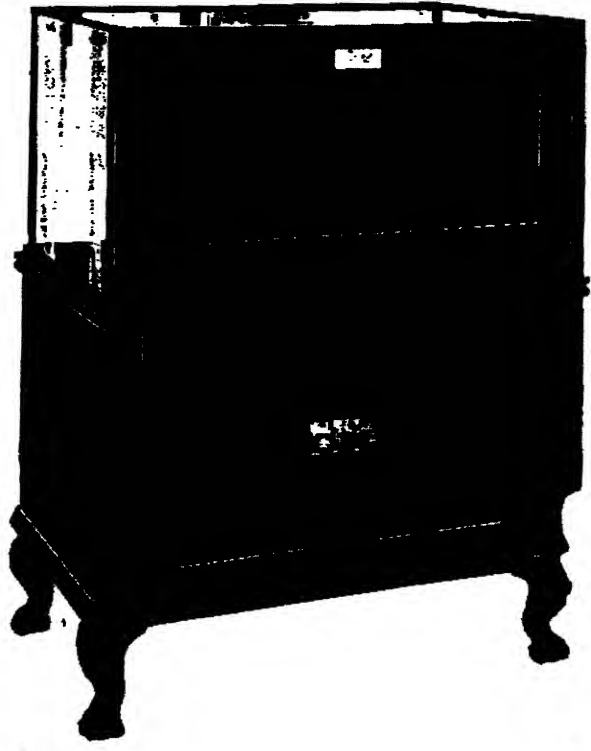
Back View of 12-Dozen Floor Case.